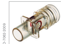
CO 2 cuvette, reusable, adults