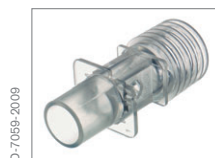
CO 2 cuvette, disposable, adults