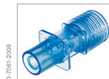
CO 2 cuvette, disposable, pediatric