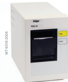
Infinity R50-N Recorder