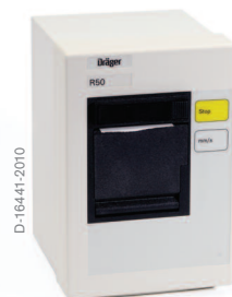
Infinity R50 Recorder